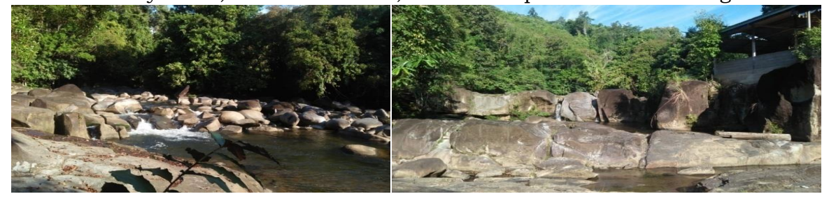
Figure 1. Batu Jato Ecotourism's View

Batu Jato ecotourism was a popular destination which frequently visited by the tourist in Sunday or national holiday season. Batu Jato ecotourism has natural beauty views, clear river water, and vast expanse of rocks along the river.